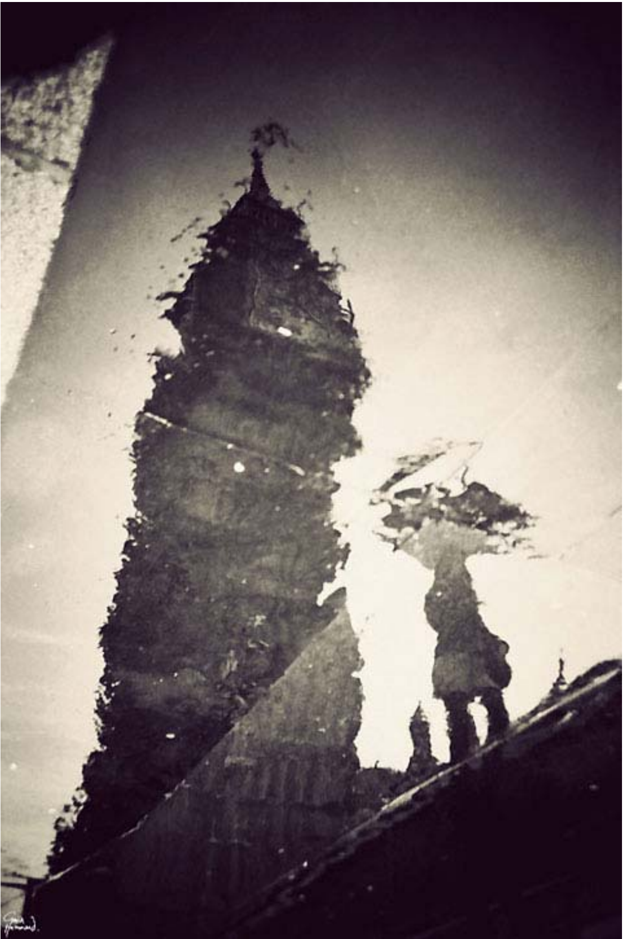
Big Ben in a puddle