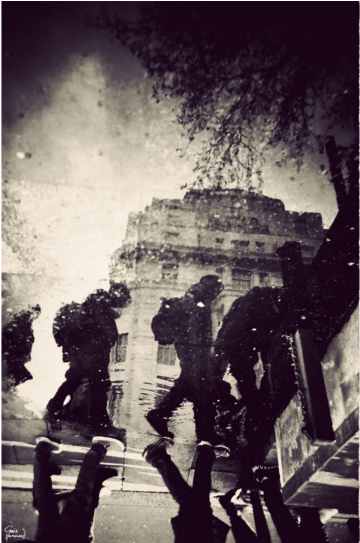
Tourists on Oxford Street in a puddle