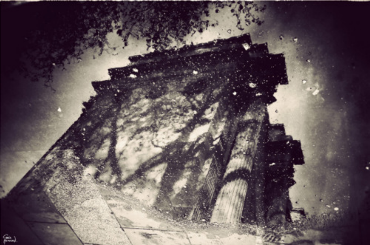
Marble Arch in a puddle