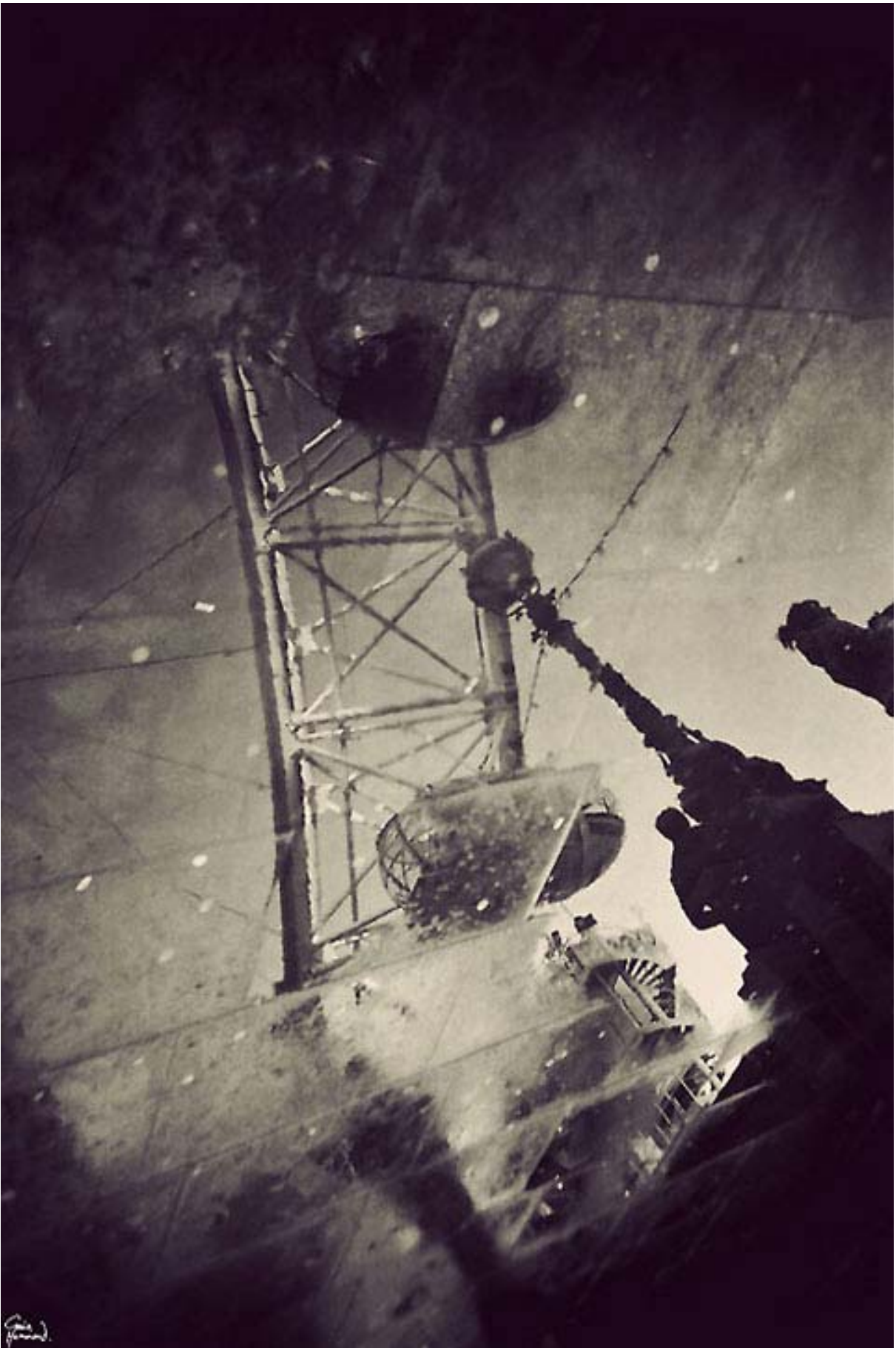
The London Eye in a puddle