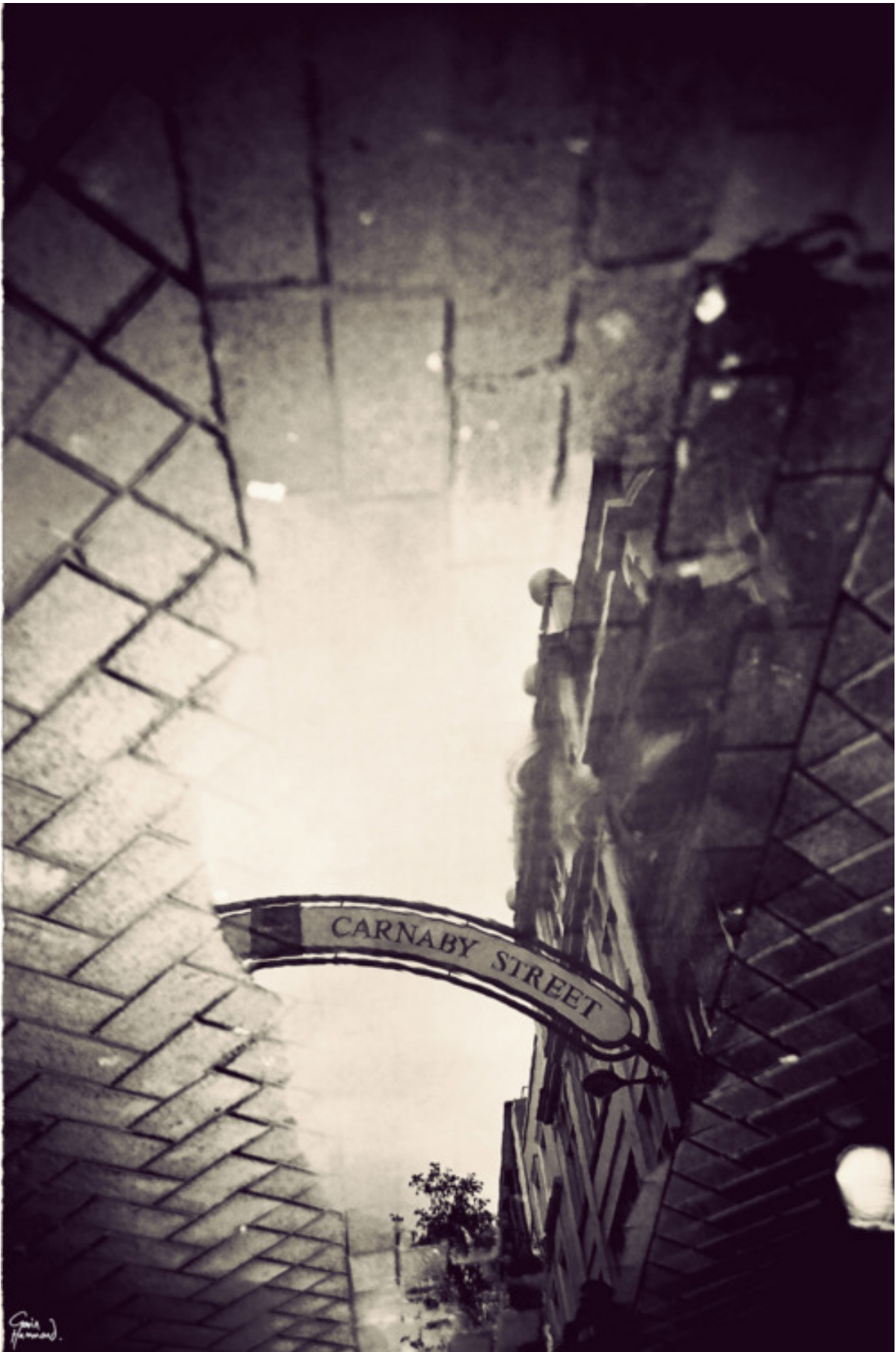
Carnaby Street in a puddle