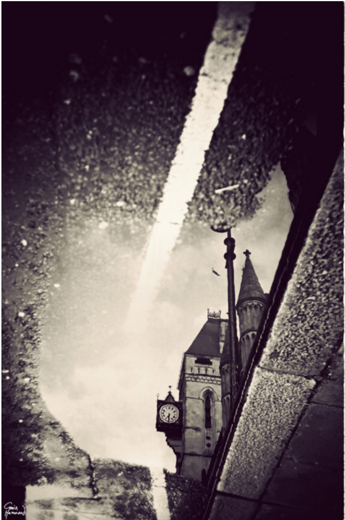
The Royal Courts of Justice in a puddle