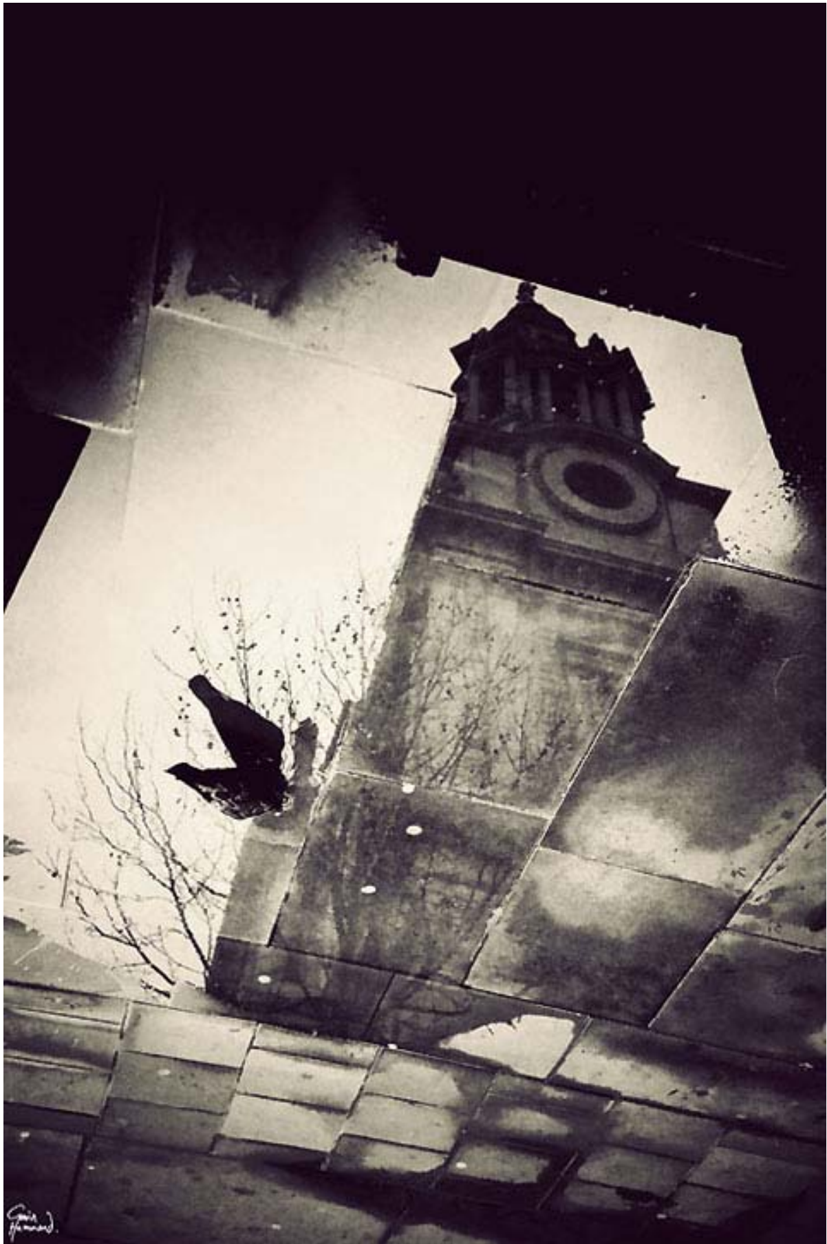
St. Paul's in a puddle