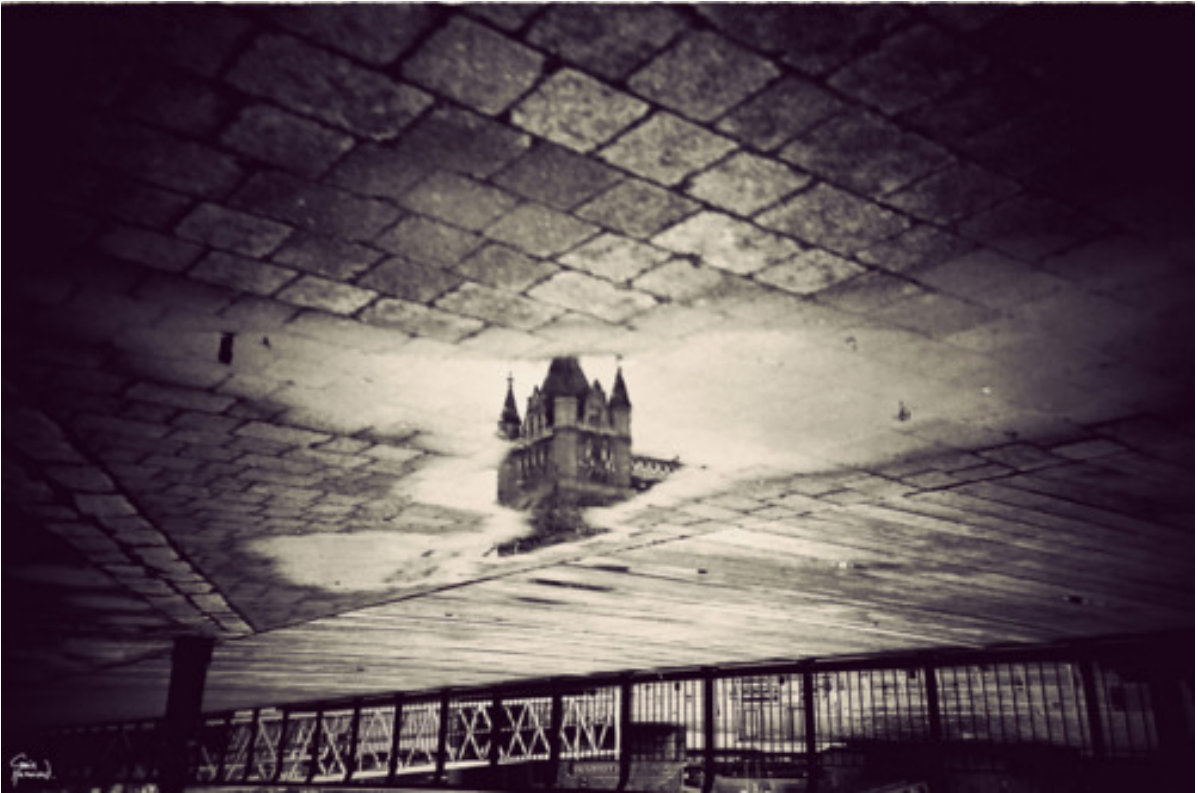
The top of Tower Bridge in a puddle